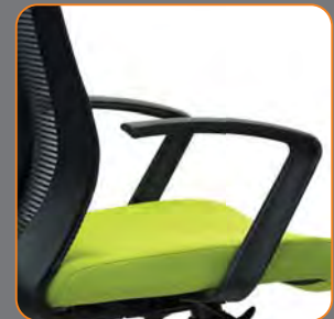
Polypropylene fixed armrest For CV series only