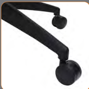
Nylon high base with twin castors