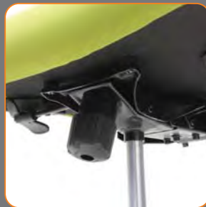
Synchro-tilt mechanism with single locking position For CV series only