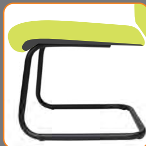
Black powder-coated steel cantilever base