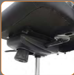
Synchro-tilt mechanism with 3 locking positions For CVA series only