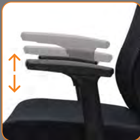
Height adjustable armrest with soft PU armpad For CVA series only