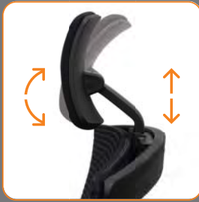
Height & angle adjustable headrest