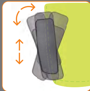
Slide & rotatable soft polyurethane armpad For CVA series only