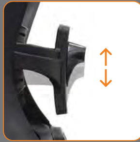
Height adjustable lumbar support standard spec for CVA series optional for CV series