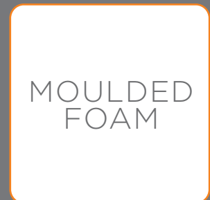
Polyurethane moulded foam