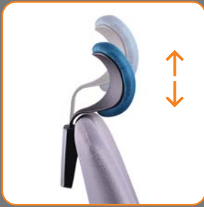
Height adjustable headrest