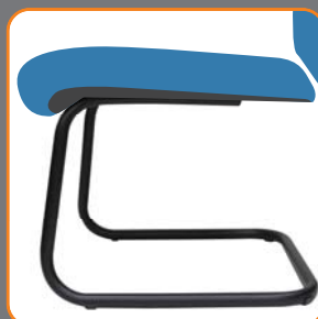
Black powder-coated steel cantilever base