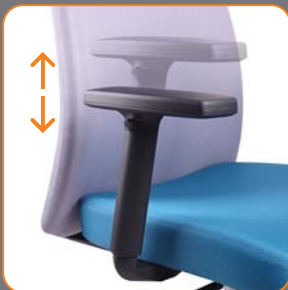
Height adjustable armrest with soft PU armpad For TLA series only