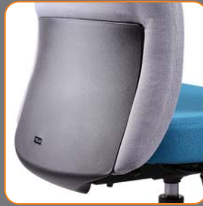
Half height polypropylene back panel