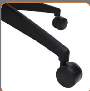
Nylon high base with twin castors