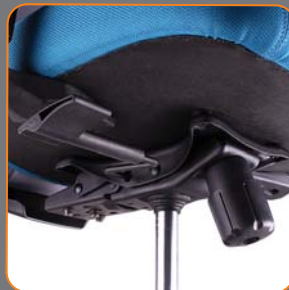
Synchro-tilt mechanism with 3 locking positions