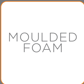
Polyurethane moulded foam