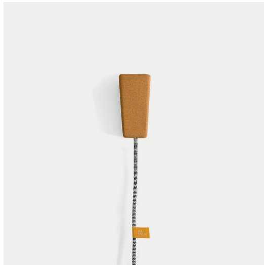
Without Bulb G_MAG G_MAG_UK