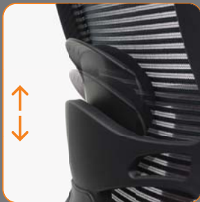
Height adjustable lumbar support