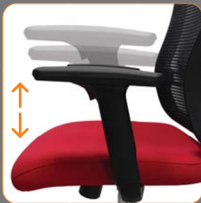
Height adjustable armrest with soft PU armpad For CA-03 only