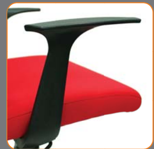
Polypropylene fixed armrest For CA-03E & CA-04E only