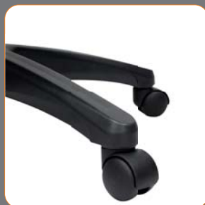
Polypropylene chair base with twin castors For CA-03E only