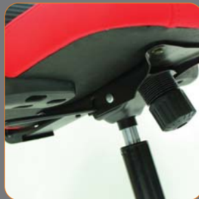
Conventional tilt mechanism with single locking position