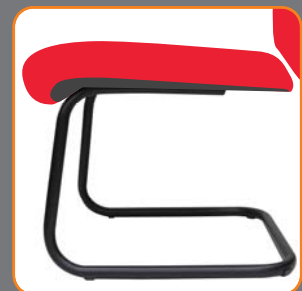
Black powder-coated steel cantilever base